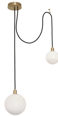
Shown in brushed brass / opaque white