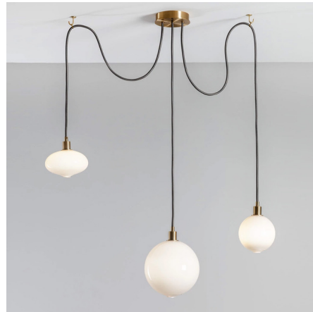
Shown in brushed brass / opaque white