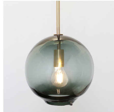
Shown in brushed nickel / transparent smoke

PRODUCT DIMENSIONS . . . . . Canopy: 5" diameter LAMP LIFE . . . . . 15000 hours COLOR RENDERING . . . . . 90 CRI LAMP COLOR . . . . . 2700K LUMENS/WATT . . . . . 100.00 LUMINOUS FLUX . . . . . 850 lumens