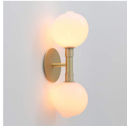
Shown in brushed brass / opaque white

The Stem 2X Wall Sconce / Ceiling Light features a pair of stunning handblown Glass globes with Brushed Brass or Dark Oxidized Brass finishes. Can be installed in any direction - horizontal, vertical, or other.