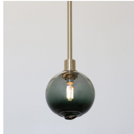
Shown in brushed brass / transparent smoke

PRODUCT DIMENSIONS . . . . . Canopy: 5" diameter LAMP LIFE . . . . . 25000 hours COLOR RENDERING . . . . . 90 CRI LAMP COLOR . . . . . 3000K LUMENS/WATT . . . . . 64.29 LUMINOUS FLUX . . . . . 450 lumens