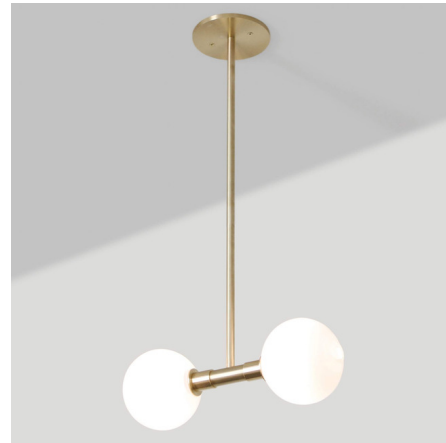
Shown in brushed brass / opaque white

PRODUCT DIMENSIONS . . . . . Canopy: 5" diameter LAMP LIFE . . . . . 25000 hours COLOR RENDERING . . . . . 90 CRI LAMP COLOR . . . . . 3000K LUMENS/WATT . . . . . 128.57 LUMINOUS FLUX . . . . . 900 lumens