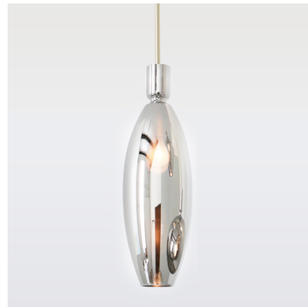
Shown in brushed brass / mirrored silver

PRODUCT DIMENSIONS . . . . . Canopy: 5" diameter LAMP LIFE . . . . . 25000 hours COLOR RENDERING . . . . . 83 CRI LAMP COLOR . . . . . 2700K LUMENS/WATT . . . . . 106.67 LUMINOUS FLUX . . . . . 800 lumens