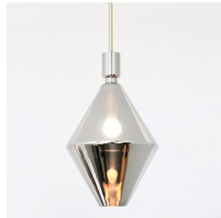
Shown in brushed brass / mirrored silver

PRODUCT DIMENSIONS . . . . . Canopy: 5" diameter LAMP LIFE . . . . . 25000 hours COLOR RENDERING . . . . . 83 CRI LAMP COLOR . . . . . 2700K LUMENS/WATT . . . . . 106.67 LUMINOUS FLUX . . . . . 800 lumens