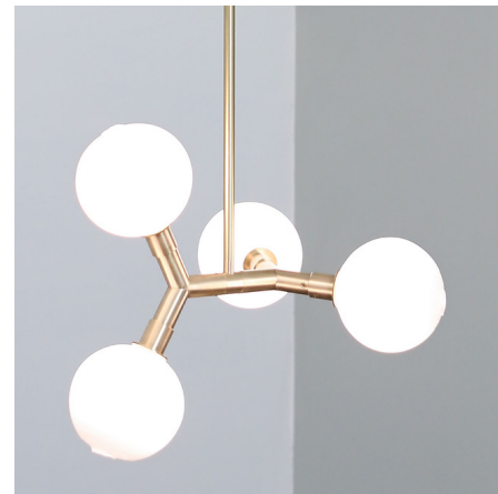
Shown in brushed brass / opaque white

The Veer Pendant features four illuminated shades of beautiful handblown glass mounted on a brass structure and stem. The 14 inch size features 4.5 inch sphere shades, the 19 inch size features 7 inch spheres, and the 15.5 inch size features 6 inch ellipsoid shades. Note: One 6 inch, two 12 inch, and one 18 inch downrods are included as standard and allow for field adjustability. Custom, non-adjustable overall heights can be specified to order (additional fees may apply).