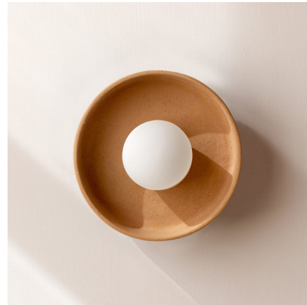
Shown in black canopy / tan clay shade

The Ceramic Disc Orb Surface Mount features a hand slip-cast shade which is left raw or pigmented, surrounding a white glass orb. Due to the handmade nature of this item, each piece is unique. Plug-In version has a Dimmer Inline Switch.