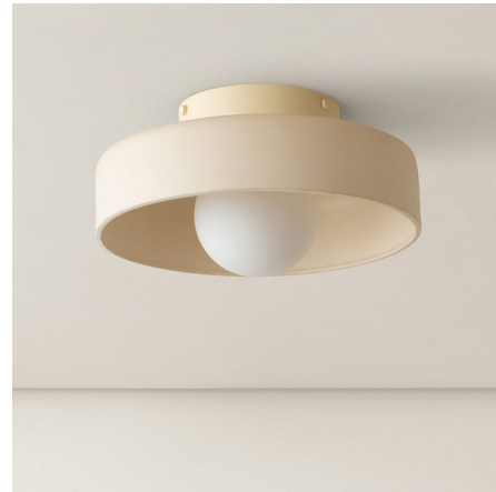
Shown in bone canopy / white clay shade

The Ceramic Disc Orb Surface Mount features a hand slip-cast shade which is left raw or pigmented, surrounding a white glass orb. Due to the handmade nature of this item, each piece is unique. Plug-In version has a Dimmer Inline Switch.