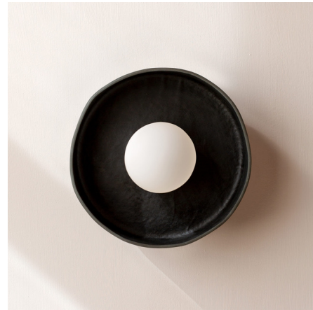
Shown in black canopy / black clay shade

The Ceramic Disc Orb Surface Mount features a hand slip-cast shade which is left raw or pigmented, surrounding a white glass orb. Due to the handmade nature of this item, each piece is unique. Plug-In version has a Dimmer Inline Switch.