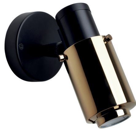
Shown in matte black / gold

The Biny Spot Wall Sconce is a clean simple piece that packs a powerful punch. Straight out of a Melies or Jules Vernes world, this piece directs light to your specific space. Biny's ball joint allows rotation of 330 degrees and an inclination of 88 degrees. Available with or without an On/Off toggle switch on the backplate as well as choice of integrated LED module or MR16 GU10 base socket.