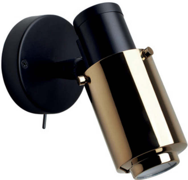
Shown in: Matte Black / Gold

The Biny Spot Wall Sconce is a clean simple piece that packs a powerful punch. Straight out of a Melies or Jules Vernes world, this piece directs light to your specific space. Biny's ball joint allows rotation of 330 degrees and an inclination of 88 degrees. Available with or without an On/Off toggle switch on the backplate as well as choice of integrated LED module or MR16 GU10 base socket.