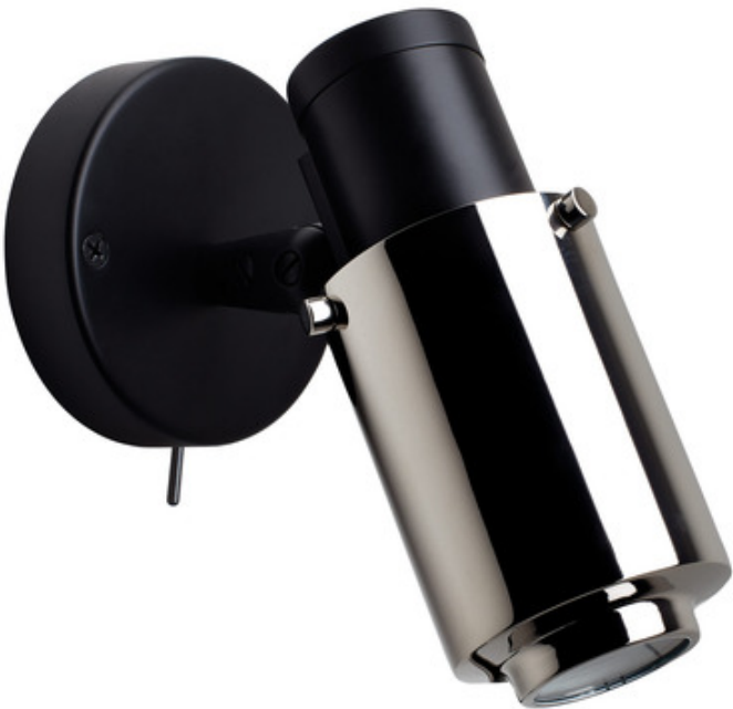
Shown in: Matte Black / Polished Nickel

The Biny Spot Wall Sconce is a clean simple piece that packs a powerful punch. Straight out of a Melies or Jules Vernes world, this piece directs light to your specific space. Biny's ball joint allows rotation of 330 degrees and an inclination of 88 degrees. Available with or without an On/Off toggle switch on the backplate as well as choice of integrated LED module or MR16 GU10 base socket.