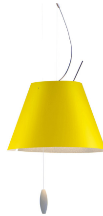
Shown in white / smart yellow

PRODUCT DIMENSIONS . . . . . Min / Max Overall Height: 39.4" / 86.7"