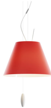
Shown in white / primary red

COLOR . . . . . Primary Red BODY FINISH . . . . . White WATTAGE . . . . . 15W DIMMER . . . . . Standard 120V DIMENSIONS . . . . . 10"W x 6.7"H BULB NOT INCLUDED . . . . . 1 x G16.5/Candelabra (E12)/15W/120V LED COUNTRY OF ORIGIN . . . . . Italy