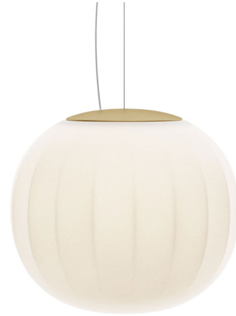
Shown in brass / opal

The Lita Pendant features a cusp patterned satin opal blown glass diffuser complemented with a cap detail in painted aluminum, brass or wood and a White canopy.