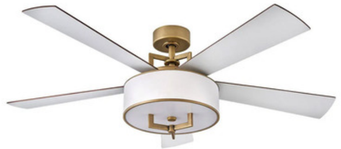
Shown in: Heritage Brass / Matte White / Birch

The Hampton Ceiling Fan with Light features a DC 153x10 motor with a 14 degree blade pitch, reversible wood blades, and integral LED light softened by an off-white linen drum shade paired with an etched acrylic bottom lens. Equivalent to two 100 watt incandescent lamps. Slope: 20 degree (may be used with a slope ceiling adapter). Includes a 6 inch downrod and 6-speed wall control with reverse. Optional remote control and accessories sold separately.