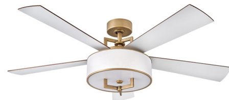
Shown in heritage brass / matte white / birch

COLOR RENDERING . . . . . 90 CRI LAMP COLOR . . . . . 3000K LUMENS/WATT . . . . . 200.00 LUMINOUS FLUX . . . . . 2400 lumens