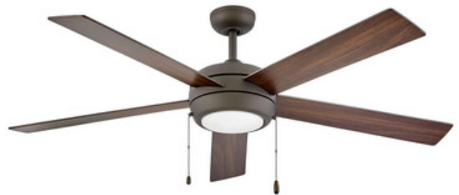
Shown in: Metallic Matte Bronze / Metallic Matte Bronze / Walnut

The Croft 60 Inch Diameter Ceiling Fan with Light features a clean, modern design with pull chain functionality. Features a 172x20 AC motor and reversible wood blades in two finish options; simply reverse the blade to select your preferred finish. Integral LED light source, equivalent to a 100 watt incandescent, with an etched opal glass shade. The light is warm dim, dimming from 3000K to warmer (dimmer not included). 3-speed pull chain, manual reverse. Includes a 4.5 inch downrod. Accessories sold separately. Available Options Brushed Nickel with reversible Silver/ Matte Black blades Chalk White with reversible Chalk White/Weathered Wood blades Metallic Matte Bronze with reversible Metallic Matte Bronze/Walnut blades Matte Black with reversible Matte Black/Walnut blades