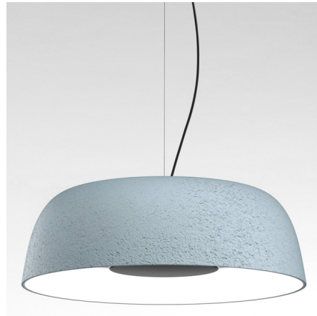
Shown in black / blue sky

PRODUCT DIMENSIONS . . . . . Adjustable Cable Length: 78.74" COLOR RENDERING . . . . . 90 CRI LAMP COLOR . . . . . 2700K LUMENS/WATT . . . . . 71.97 LUMINOUS FLUX . . . . . 2519 lumens