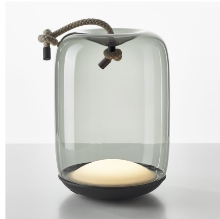
Shown in matte black / glossy smoke grey

The Knot Battery Portable Lamp features a sleek handblown glass shade and natural rope handle for an intriguing juxtaposition of materials. The rough texture of the rope contrasts with the smooth glass surface to combine modern elegance with a timeless accent. Available with Glossy glass or Matte glass inner surface. Battery lasts up to 4.5 hours at the brightest setting. On, off, and brightness settings are controlled by a touch dimmer in the base. IP44 rated. Includes USB charging cable.