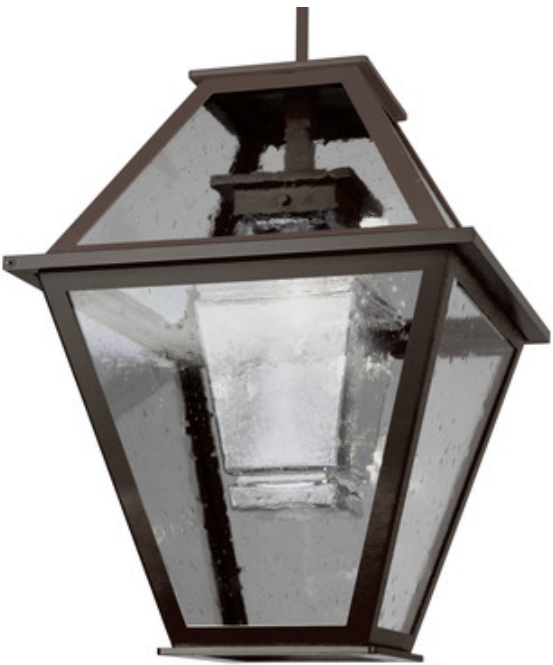
Shown in: Statuary Bronze / Clear Seeded

The Terrace Nested Outdoor Pendant brings the timeless yet relevant look of old world lanterns to your exterior space, with its clean simple silhouette. Features a super durable AAMA 2604 rated finish. Available with Incandescent or integrated LED lamping options