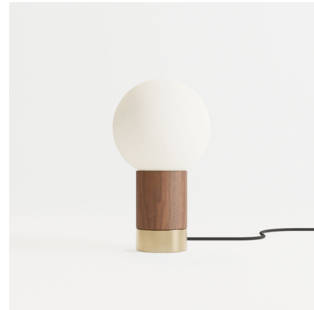
Shown in walnut / brushed brass

The Catkin Table Lamp offers a simple, yet versatile design that features a White hand blown glass globe shade set into a wooden socket holder, like a spring bud emerging from a tree trunk, waiting to blossom. Available in Walnut, Black Oak, White Oak, or Natural Oak with Brushed Brass, Brushed Copper, or Brushed Stainless accents.