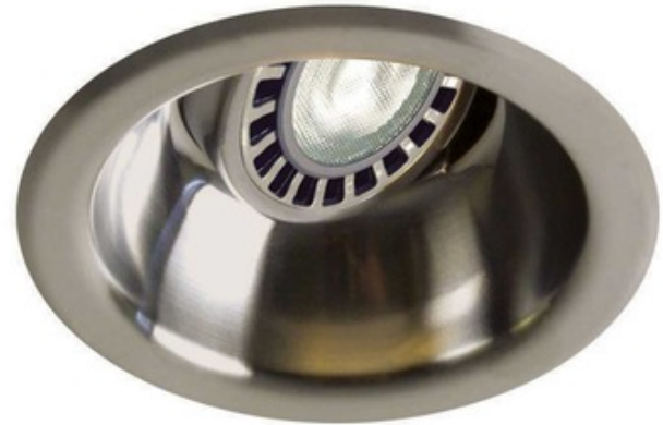
Shown in: Satin Nickel

T3000 3.5 Inch Round Deep Regressed Adjustable Trim is available in a powder coat painted or plated die-formed steel finish in White, Black, Gold Plated 24K, Chrome, Brushed Chrome, Architectural Bronze, Antique Copper, Matte White, Brushed Nickel, Satin Nickel, Metallic Grey or Antique Nickel. Lamp options include 12 volt GU5.3 MR16 halogen up to 50 watts, 120 volt PAR16 LED up to 8 watts, 12 volt GU5.3 MR16 LED up to 11.5 watts, 120 volt GU10 MR16 halogen up to 50 watts, and 120 volt GU10 MR16 LED up to 9.8 watts. Use supplied glass lens only with MR16 lamps with no glass cover. See attached manufacturer specification for housing/trim combination options. See housing specification for dimmer information. UL listed. Suitable for damp locations. 1 year warranty. 3 5/8 inch ceiling cutout. 4.5 inch diameter x 1.9 inch height. 2.25 inch aperture. A complete fixture includes a housing and trim, sold separately.