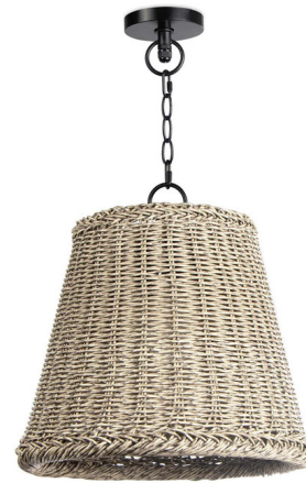
Shown in white / white wash