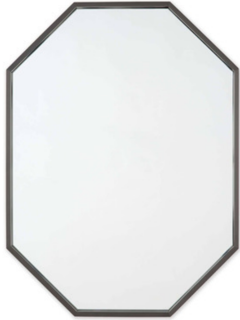
Shown in: Blackened Steel / Mirror

The Hale Wall Mirror brings a clean refined look to your interior space. The simple clean lines is perfect for any space.