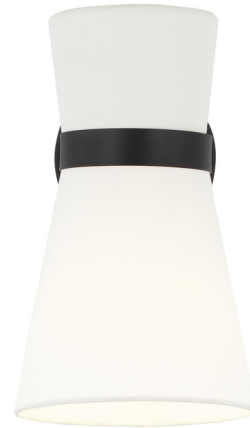
Shown in midnight black / white linen

The Clark Wall Sconce brings a clean tailored look to your interior space. The slim cone shaped linen fabric shade is lightly cinched with a metal band. Available with Incandescent and LED lamp options. LED option is Title 24 Compliant. Note: Included LED bulb option is available with Brushed Nickel finish only.