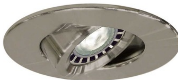
Shown in: Satin Nickel

T3250 3.5 Inch Round Low Profile Adjustable Trim is made of plated die-formed steel or powder coat painted finish. Trim finish available in White, Black, Gold Plated 24K, Chrome, Brushed Chrome, Architectural Bronze, Antique Copper, Matte White, Brushed Nickel, Satin Nickel, Metallic Grey or Antique Nickel. See attached manufacturer specification for housing/trim combination options. Lamp options include 12 volt GU5.3 MR16 halogen up to 50 watts, 120 volt PAR16 LED up to 8 watts, 120 volt GU5.3 MR16 LED up to 11.5 watts, 120 volt GU10 MR16 halogen up to 50 watts, and 120 volt GU10 MR16 LED up to 9.8 watts. Use supplied glass lens only with MR16 lamps with no glass cover. See housing for dimmer information. UL listed. Suitable for damp locations. 1 year warranty. 3 5/8 inch ceiling cutout. 4.4 inch diameter x 1.2 inch height. 2.6 inch round aperture. A complete fixture includes a housing and trim, sold separately.