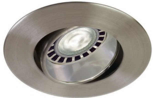
Shown in: Satin Nickel / Anodized Reflector

T3450D-SM 3.5 Inch Smooth Regressed Adjustable Trim is made of plated die-formed steel or powder coat painted finish with smooth anodized aluminum reflector standard. Trim finish available in White, Black, Gold Plated 24K, Chrome, Brushed Chrome, Architectural Bronze, Antique Copper, Matte White, Brushed Nickel, Satin Nickel, Metallic Grey or Antique Nickel. Additional reflector finishes include specular Clear or Black, or painted White, Black or Matte White. See attached manufacturer specification for housing/trim combination options. Lamp options include 12 volt GU5.3 MR16 halogen up to 50 watts, 120 volt PAR16 LED up to 8 watts, 12 volt GU5.3 MR16 LED up to 11.5 watts, and 120 volt GU10 MR16 LED up to 9.8 watts. Use supplied glass lens only with MR16 lamps with no glass cover. See housing for dimmer information. UL listed. Suitable for damp locations. 1 year warranty. 3 5/8 inch ceiling cutout. 4.4 inch diameter x 2 inch height. 2.6 inch diameter aperture. A complete fixture includes a housing and trim, sold separately.