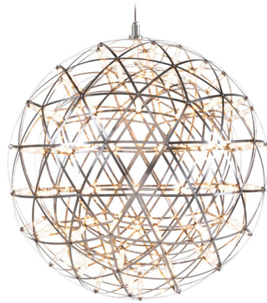
Shown in stainless steel