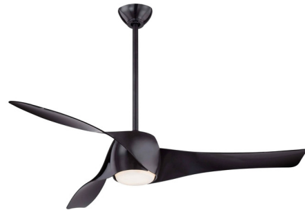
Shown in coal / etched opal

LAMP LIFE . . . . . 30000 hours COLOR RENDERING . . . . . 92 CRI LAMP COLOR . . . . . 3000K LUMENS/WATT . . . . . 40.45 LUMINOUS FLUX . . . . . 809 lumens