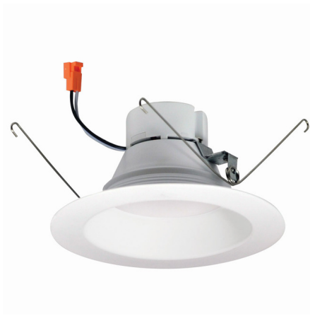
Shown in white reflector / white flange