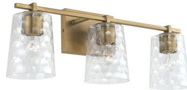
Shown in aged brass / clear

With tapered honeycomb glass shades set on a clean metal frame, the Burke Bathroom Vanity Light adds a sophisticated accent to bathrooms and powder rooms. It can be installed facing up or down.