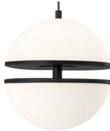
Shown in matte black / white