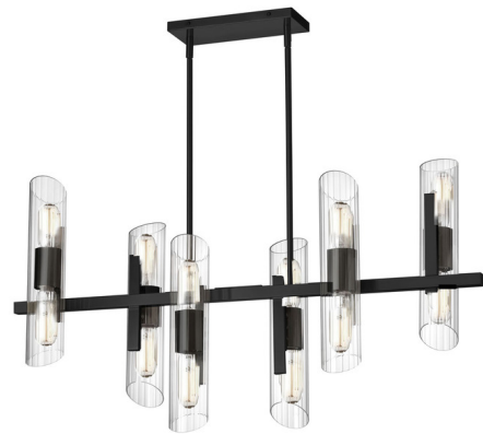
Shown in matte black / clear

The Samantha Linear Chandelier is an ornate piece making time inside the dining room or kitchen a memorable one. It's a dashing piece hanging over a table surface with a sleek metal structure. The metal gives the piece a pop of rich color that draws the eye from across the room. Also catching the eye, clear fluted glass produces elegant linear marks in the air and reflective accents.