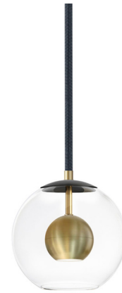
Shown in black / natural aged brass / clear

PRODUCT DIMENSIONS . . . . . Canopy: 6" diameter LAMP LIFE . . . . . 40000 hours COLOR RENDERING . . . . . 90 CRI LAMP COLOR . . . . . 3000K LUMENS/WATT . . . . . 70.00 LUMINOUS FLUX . . . . . 560 lumens