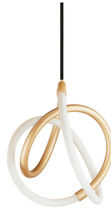
Shown in gold / white acrylic

PRODUCT DIMENSIONS . . . . . Canopy: 5.5" diameter LAMP LIFE . . . . . 40000 hours COLOR RENDERING . . . . . 90 CRI LAMP COLOR . . . . . 3000K LUMENS/WATT . . . . . 75.00 LUMINOUS FLUX . . . . . 900 lumens