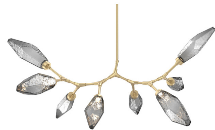
Shown in gilded brass / chilled smoke

PRODUCT DIMENSIONS . . . . . Adjustable in 3 inch increments from 26" - 83" COLOR RENDERING . . . . . 93 CRI LAMP COLOR . . . . . 3000K LUMENS/WATT . . . . . 553.85 LUMINOUS FLUX . . . . . 1440 lumens