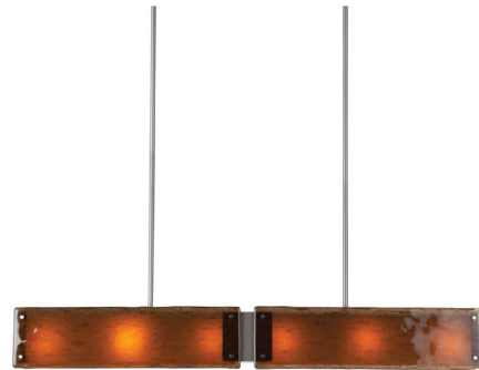
Shown in beige silver / bronze granite

The Textured Glass Linear Pendant brings a visual masterpiece to your interior space. Each of the panels of glass requires skilled artisan precision and two kiln passes to achieve this stunning look. Each piece is a unique work of art. Sloped ceiling adaptable to a max of 45 degrees. Adjustable in 3 inch increments.