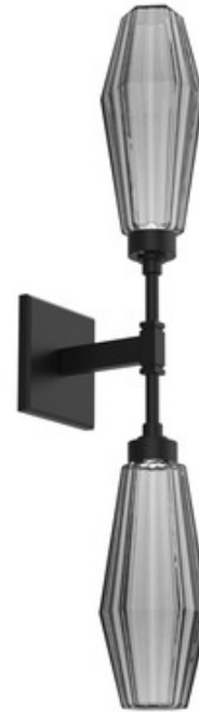
Shown in: Matte Black / Optic Ribbed Smoke

The Aalto Double Wall Sconce features LED-lit hand-blown glass shades that are meticulously crafted by Hammerton artisans. The fixture gives a nod to an organic midcentury modern aesthetic that exudes casual sophistication. Each shade takes the place of a traditional bulb and unfolds with striking illumination. The finished look is relaxed, soft and unique. Can be mounted in a vertical or horizontal position.