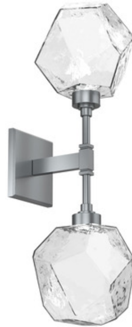
Shown in: Satin Nickel / Clear

The Gem Double Wall Sconce is jewelry for your home. Features gems of LED lit hand blown glass that are meticulously crafted by Hammerton artisans. The fixture gives a nod to an organic aesthetic that exudes casual sophistication. Each shade takes the place of a traditional bulb and unfolds with striking illumination. The finished look is relaxed, soft and unique. Each glass shade is a one-of-a-kind artisan creation. Available with 2700K or 3000K color temperature options.