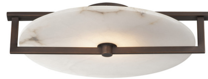
Shown in dark bronze / alabaster

Modern in execution, yet representative of the classic inverted bowl pendants, the Quarry Wall Sconce/Ceiling Light features natural Spanish alabaster in an iron frame finished in Darkened Bronze. An inverted bowl form is created using the alabaster's straight line and the empty space below it. Slim housings of LED direct light both up at the alabaster to highlight the stone's character and another direct light downward for functional use below. can be mounted as a ceiling light or wall sconce.