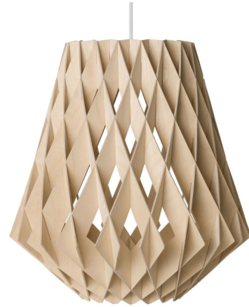
Shown in natural

The Pilke Pendant was created by the industrial designer Tuukka Halonen. Pilke is a Finnish word that means twinkle. Pilke shades are constructed of identical interlocking parts and the repetition of plywood parts which creates a beautiful three dimensional, geometrically decorative light shade. Pilke is entirely made in Finland of birch plywood and assembled by local craftsmen.