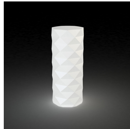
Shown in ice

PRODUCT DIMENSIONS . . . . . Cord Length: 120" LAMP LIFE . . . . . 50000 hours COLOR RENDERING . . . . . 80 CRI LAMP COLOR . . . . . 4500K LUMENS/WATT . . . . . 233.33 LUMINOUS FLUX . . . . . 2800 lumens