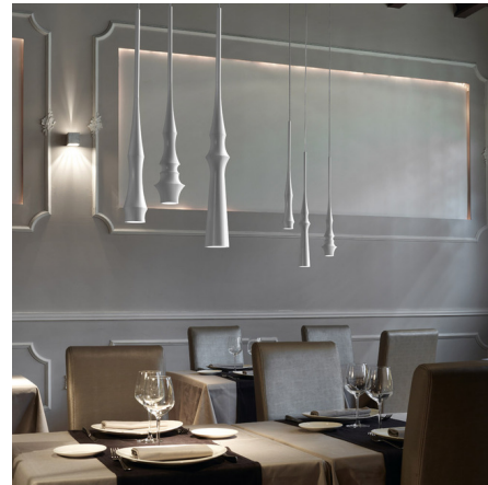
Shown in white / matte white

The Slend Multi-Light Pendant with Linear Canopy features three aluminum shades of different shapes on one central linear canopy. Includes 5 watt 2700K 120 volt GU10 MR16 LED lamps. Includes field adjustable cable to adjust hanging heights.