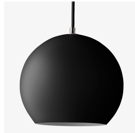
Shown in matte black / matte black

With its bold spherical silhouette, the Topan VP6 Pendant was truly ahead of its time when developed in 1959, and was a precursor to the Pop Art Movement. The shade is skillfully spun from a single piece of aluminum into its perfectly rounded form. Not only a source of illumination, this sculptural piece is a chic decorative element for your space whether suspended alone or in clusters.