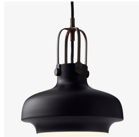
Shown in bronzed brass / matte black

The Copenhagen Pendant carries an industrial feel yet is elegant and poetic at the same time. An exercise in contrasts, it combines the classic and the modern, the maritime and the industrial. It is available with either a mouth-blown Opal glass shade that creates a diffused warm glow, or a Matte Black spun metal shade for a more directional up and down light. Placed in an office or over a dining table, the Copenhagen provides instant ambiance with sophistication. Non-UL versions have a black fabric cord, while the UL versions have a black PVC cord. Note: The 23.6 inch size is only available with a Matte Black shade. The non-UL version of the 7.8 inch size includes an internal glass diffuser to cover the G9 base bulb. The UL-listed version requires a candelabra base bulb, which the diffuser will not fit.