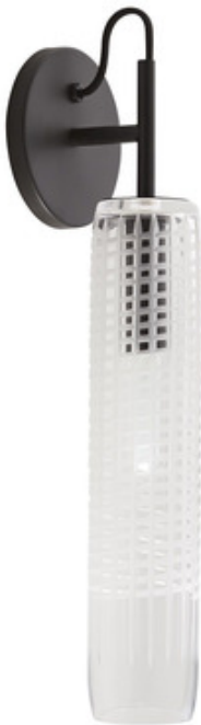
Shown in: Blackened Steel / Etched Glass

The Cut Wall Sconce offers a modern twist on a classic look. The etched glass shade, with its deeply grooved texture, casts patterned shadows and light across your room.