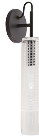
Shown in blackened steel / etched glass

The Cut Wall Sconce offers a modern twist on a classic look. The etched glass shade, with its deeply grooved texture, casts patterned shadows and light across your room.