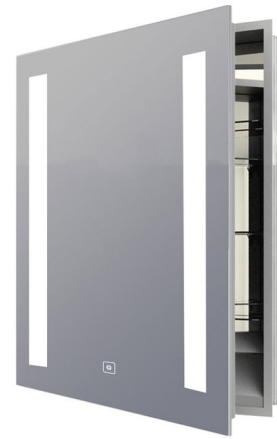
Shown in matte silver / mirror